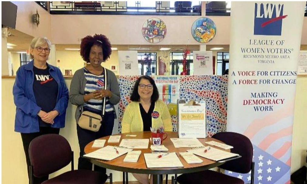
Voter Registration table at J Sargeant Reynolds CC on Constitution Day, Sept. 18