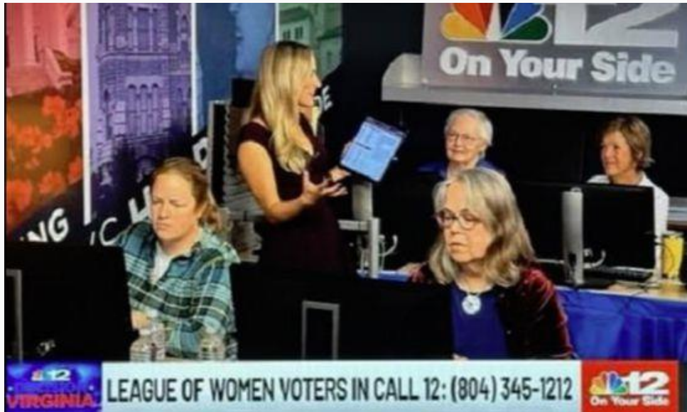
Leaguers answer phones for Call 12 on Election Day, November 7