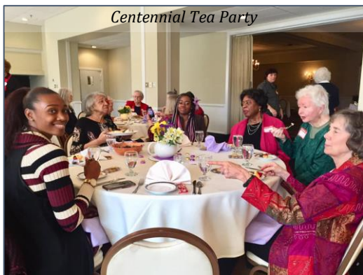
Centennial Tea Party