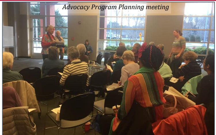
Advocacy Program Planning meeting