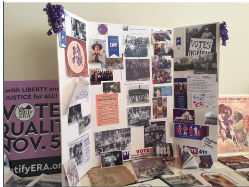
Memorabilia display at the Centennial Tea