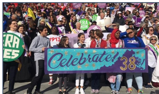
Parade on International Women's Day, Celebrating Virginia's passage of ERA

Section 4. Participation. All in-person meetings are open to the general public. Nonmember participation is inappropriate at decision-making meetings.