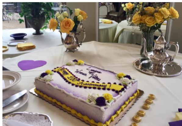
100th Anniversary cake