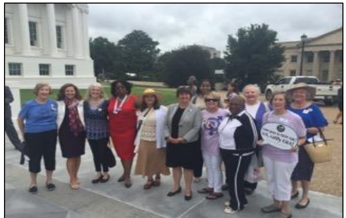
League members at Women's Equality Day at the Capitol

The League is proud to be nonpartisan, neither supporting nor opposing candidates or political parties at any level of government, but always working on vital issues of concern to members and the public.