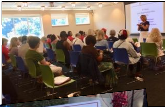
Voter Registration Training in July