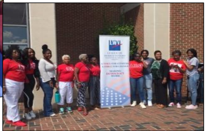
LWV-RMA and the Deltas at VUU Voter Registration