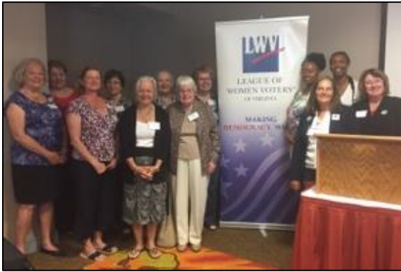
LWV-RMA members at Fall Workshops

Twelve members of the LWV-Richmond Metro Area joined members from local leagues around the state at the LWV-Virginia Leadership Training Workshops in Fredericksburg on September 14th. The day's stellar agenda encompassed a wide range of topics from Getting Out the Vote to the 2020 Census. View the workshop documents and materials now available online at https://lwv-va.org/2019-lwv-va-workshops/ .