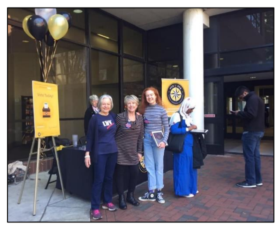
LWV-RMA assisted with VCU student elections